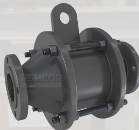
ASHCOR flame arresters